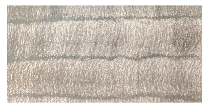
Proper Coverage on Insulation